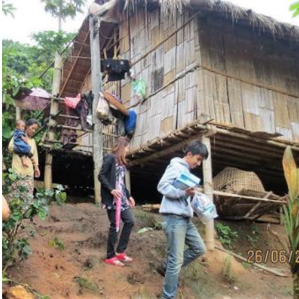
Arm delivers the provisions to a village along the Myanmar Border

The Outreach Team makes regular visits to remote Hill-Tribe and Migrant villages in Northern Thailand close to the Myanmar Border.