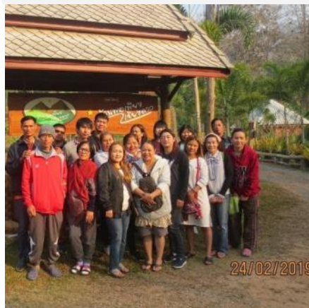
Volunteers (HIV+ve) and hospital staff at their annual overnight get-together

Rejoice Hosts the Annual Overnight Get-together. Volunteers from the rural hospital and hospital staff are invited to attend.