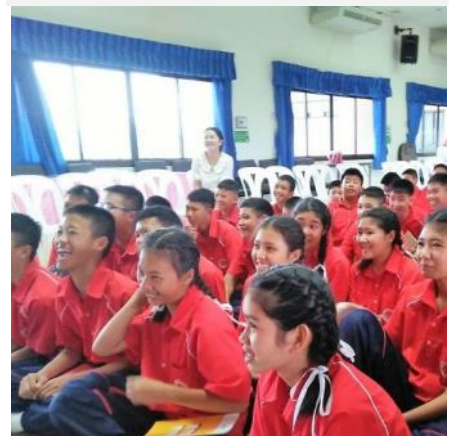
Education and Prevention Class at Municipal School 1, Chai Prakarn District

Over 2,000 children have attended reproductive health and STD prevention classes organised by Rejoice and Healthcare workers.