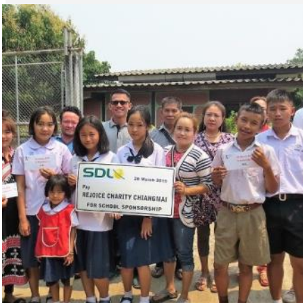
Some of the Children sponsored by SDU receiving their scholarships in Chiang Dao

64 students benefit from the School Scholarship Programme mainly supported by individuals on an annual basis.