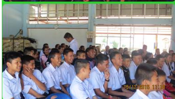
Baan Pangtonduea School, Mae Ai