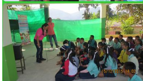
Chotikunakasem Baan Muangngam School, Tha Ton