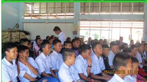
Baan Pangtonduea School, Mae Ai