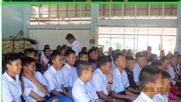
Baan Pangtonduea School, Mae Ai