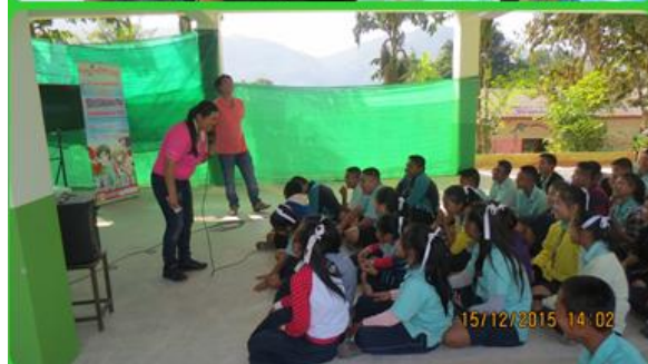
Chotikunakasem Baan Muangngam School, Tha Ton